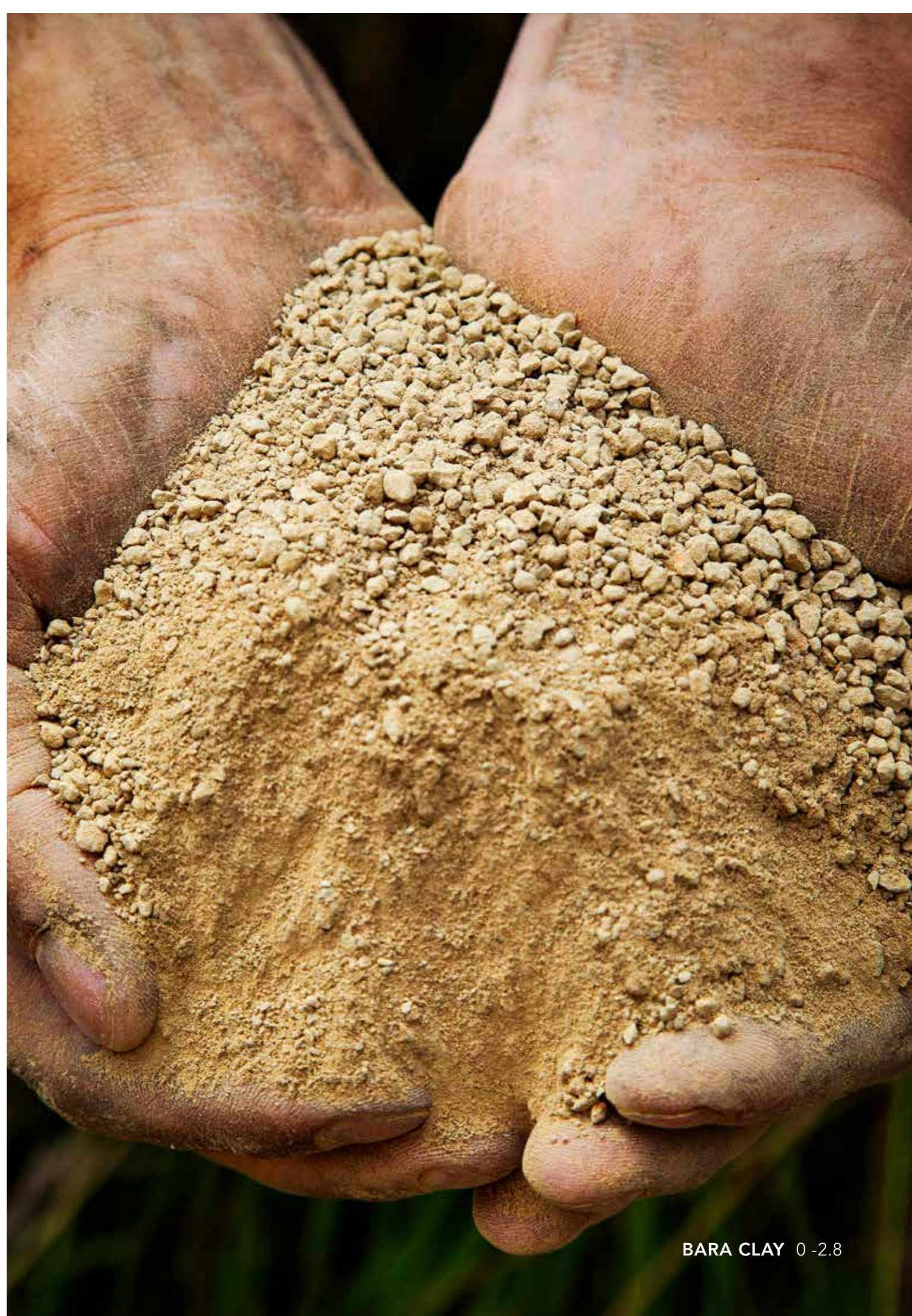
BARA CLAY 0-2.8