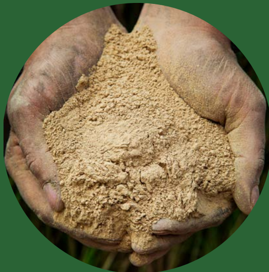
Bara Clay Oxywet Powder

Would you like to try Bara Clay and experience the difference it can make in your professional cultivation?