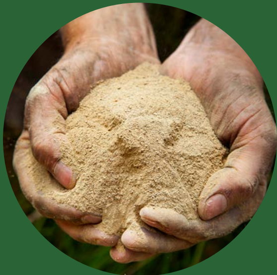
Bara Clay 0-1