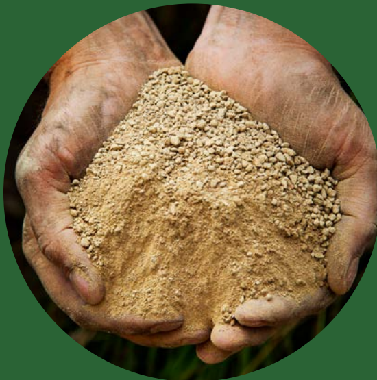
Bara Clay 0-2,8