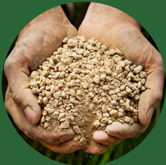
Bara Clay 2-6