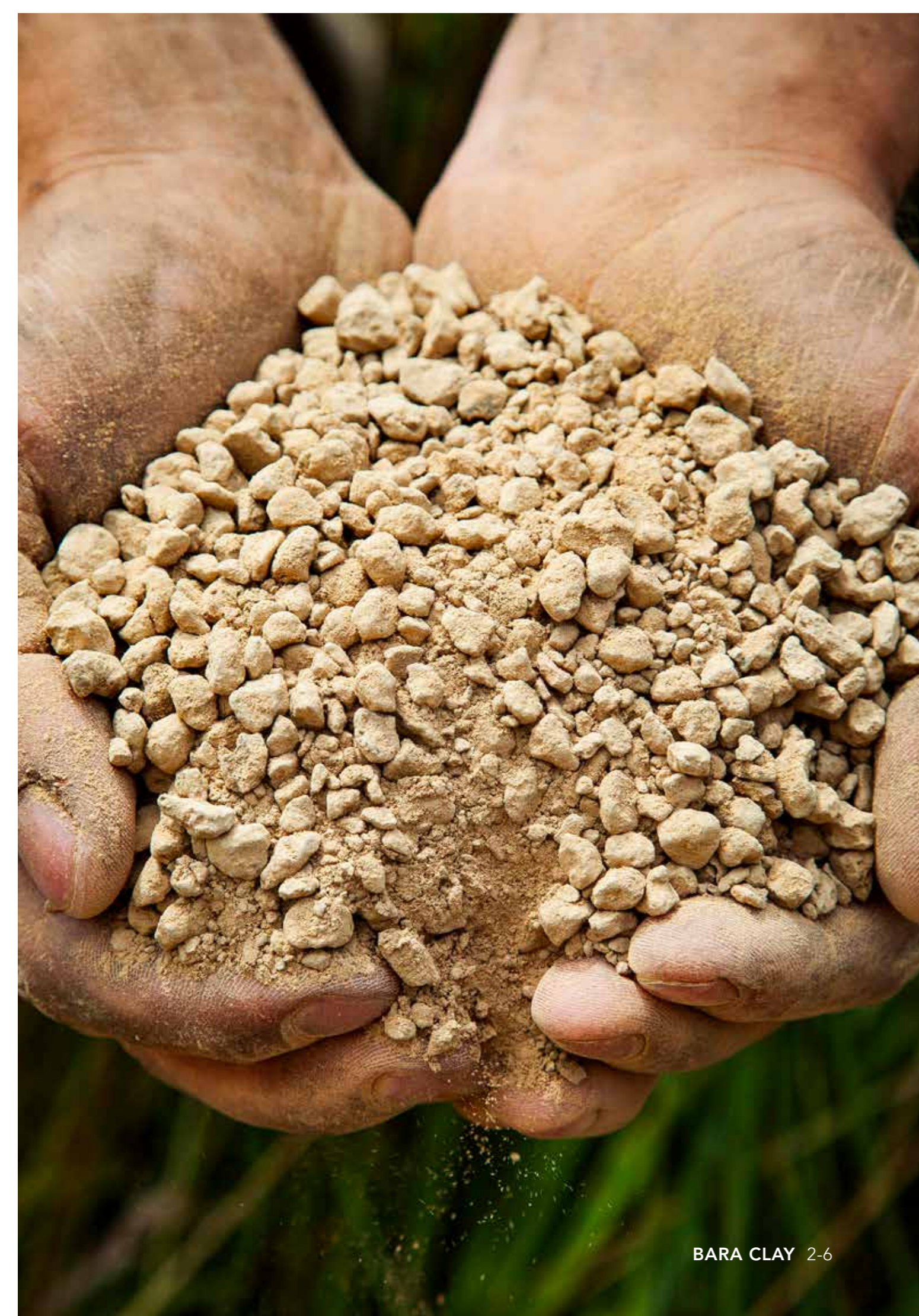
BARA CLAY 2-6