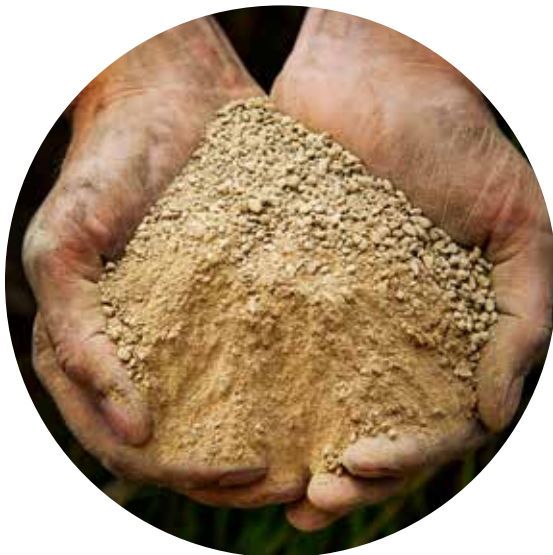
Bara Clay 0-2,8