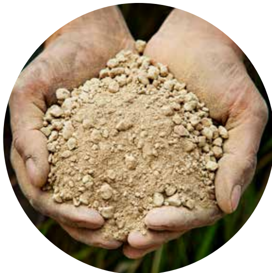
Bara Clay Calcium Plus