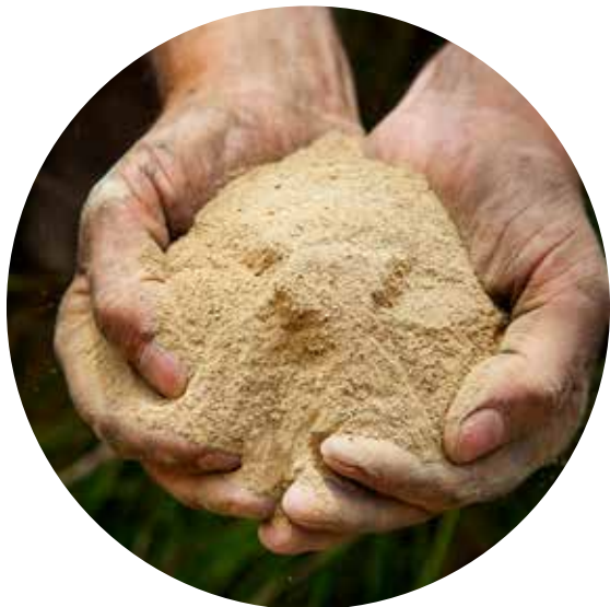
Bara Clay 0-1