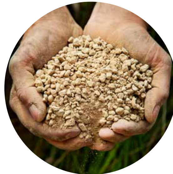
Bara Clay 2-6