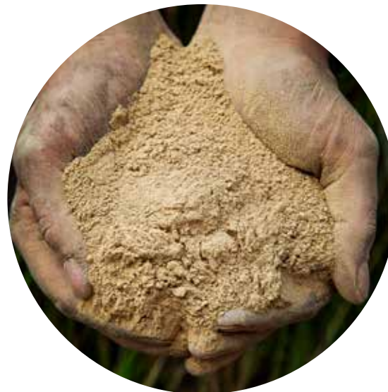
Bara Clay Oxywet